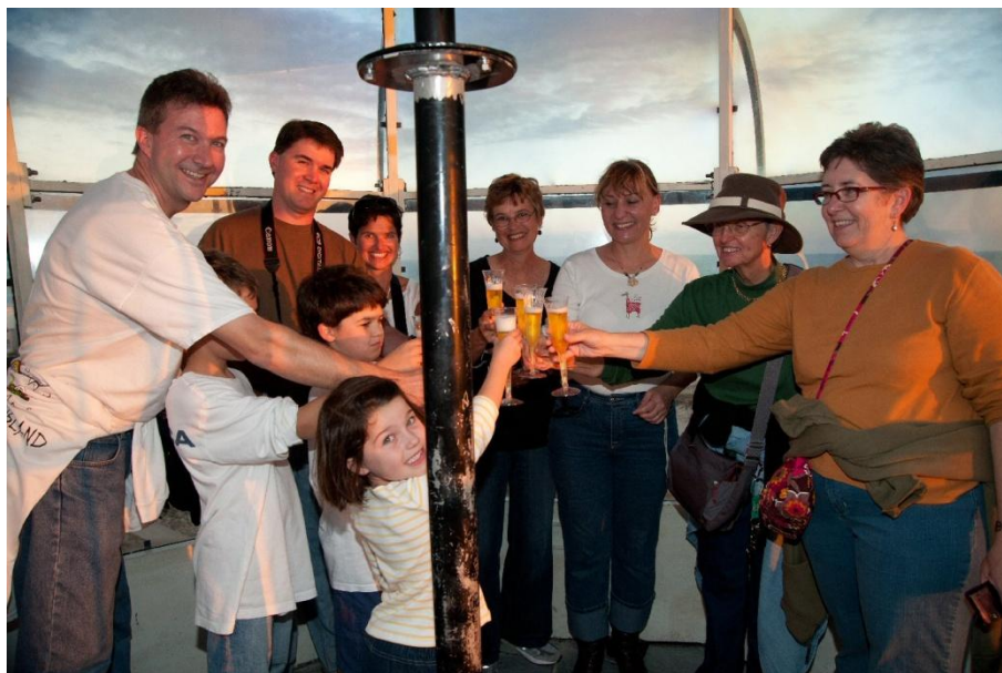
Full Moon Climbers toast the moon from the lantern room of the Cape St. George Light.