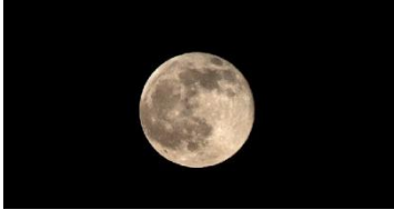
Image of the Full Moon taken from the top of the lighthouse.

lighthouse on evenings of the full moon.