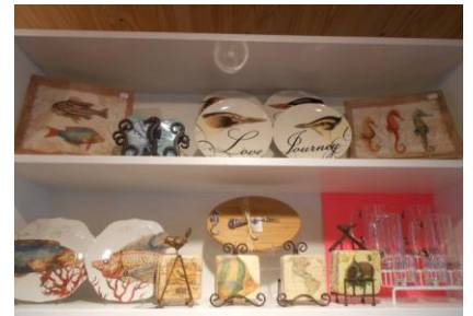
Hostess gifts galore!

beer steins and shot glasses etched with an image of the lighthouse, and our ever-popular wide-handled black lighthouse mugs.