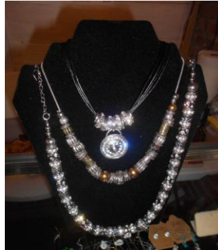
Bling lights up the holidays!

carved and make great stocking stuffers.