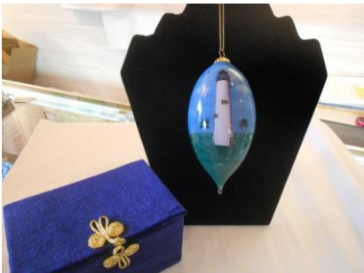
Painted glass ornament.