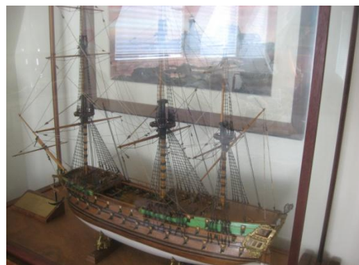
NORSKE LOVE DANISH 1765

The original ship was 248 feet in length, 222 feet tall, and had a beam of 50 feet. Dr. Wilder built the model with a scale of one inch equal to 75 feet. The model is enclosed in a glass case which is 45 inches long, 18 inches wide and 40 inches tall. It sits on its own custom table, which is included in the donation.