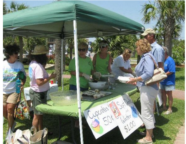
Volunteers serve the crowd.

Local musicians "Up Close" entertained from the porch of the Keeper's House, and delighted lighthouse climbers and park visitors with their laid back sound.