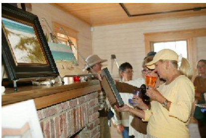
Reception at the Keeper's House.

Following the afternoon of painting on the island, the St. George Lighthouse Association, one of the hosting partners of the Plein Air Paint-Out, sponsored a reception for artists and patrons in the Keepers House. More than 100 people came to meet the artists and view the day’s paintings.