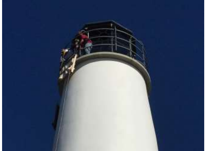
Replacement panel arrived safely to the top of the lighthouse, ready to be installed