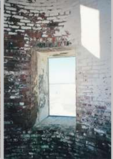
A view through the tower window