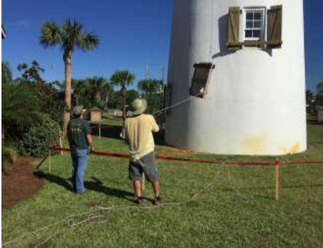
Hoisting a boxed replacement panel of glass to the top of the lighthouse.

Experts that we have spoken with have different explanations, and your guess is as good as ours. The two panes cracked on different days within weeks of each other, and we are working on identifying a cause and solution to the issue.