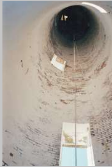
Looking up the tower years after the Coast Guard had removed the stairs

Like every other person who visited the lighthouse in those years, we were stunned when the lighthouse collapsed on October 21, 2005. The trip gives us a better perspective on the amazing achievement by members of the St. George Lighthouse Association who salvaged the tower and rebuilt it in Lighthouse Park. Thanks to their hard work and dedication, visitors can now visit the museum and gift shop and learn the history my son and I did not yet know, and then climb the stairs to the tower for an unforgettable experience.