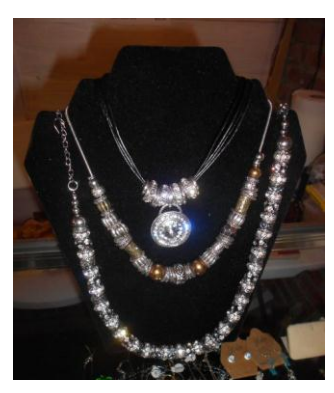
Bling lights up the holidays!

carved and make great stocking stuffers.