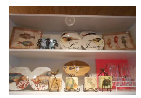
Hostess gifts galore!

beer steins and shot glasses etched with an image of the lighthouse, and our ever-popular wide-handled black lighthouse mugs.