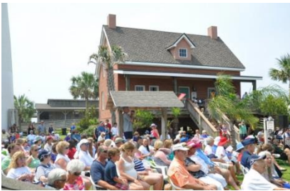
The Memorial Day crowd in Lighthouse Park.