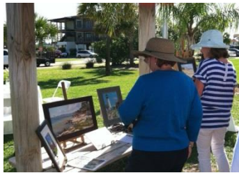
Art patrons at the reception.

a vantage point in the park. Also gathering of amateur artists, many of especially to follow the professional