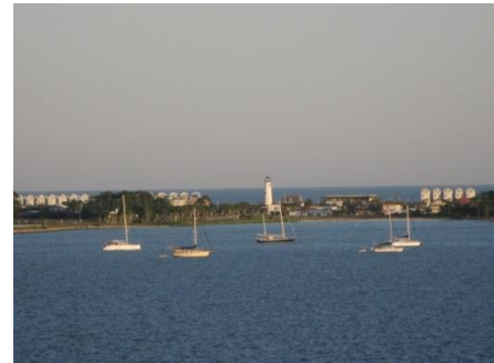
If this looks like some tranquil Caribbean anchorage, look again. These sailboats spent the night in our little harbor in early May. The great view of the Lighthouse must have attracted them!