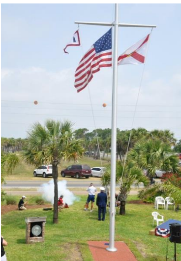
Flag at half-staff during 21-Gun Salute.