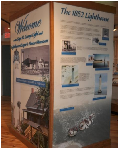
The history of the 1852 Lighthouse is told in words and pictures.