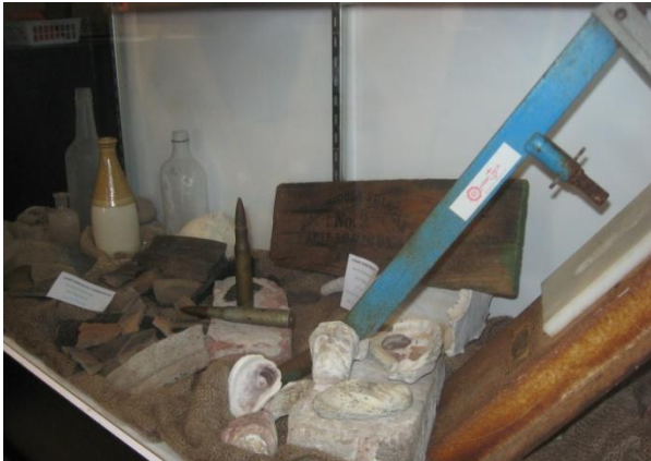
Vintage bottles, Indian pottery shards, and a unique oyster opening device are on display.