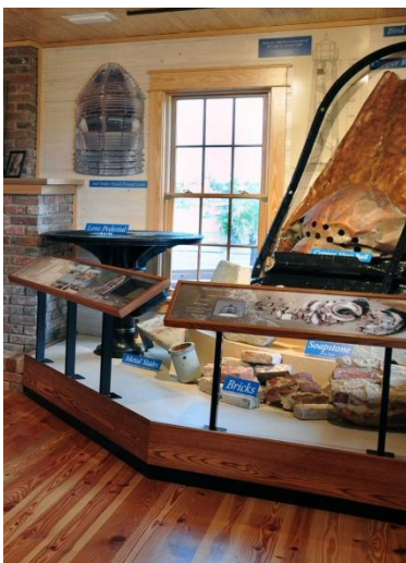
Pieces of the 1852 Lighthouse are on display.

After months of research, writing text, searching for photos, identifying artifacts, proofing, re-proofing, and re-proofing yet again, the truck carrying the exhibits for Phase 1 of the Lighthouse Museum rolled onto the island late in the day on Wednesday, July 27.