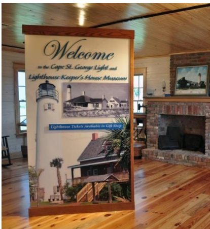
The Welcome Kiosk includes photos of the original and the current Keeper's House.

This issue of "Light Reading" celebrates the opening of the Lighthouse Museum and the Keeper's House Gift Shop in the Lighthouse Keeper's House. The late August opening explains why the Summer 2011 edition is a little late arriving. (Technically it is still summer, even though the families and children who crowded the lighthouse in June and July are long gone back to school!)