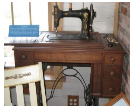
The Damascus sewing machine used by Keeper's wife Bessie Roberts.

On August 21, it was SHOWTIME -- and we were ready!