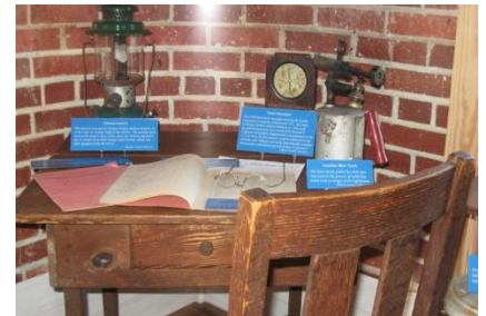
The Keeper's desk in the Lighthouse watchroom.