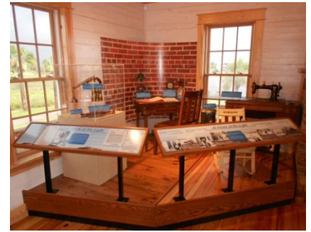
The "Keeper's Corner" depicts the life of the Keeper at home and at work.