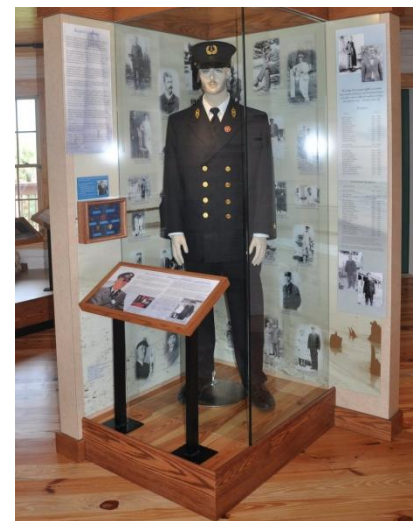
Stan Farnham's keeper's uniform.