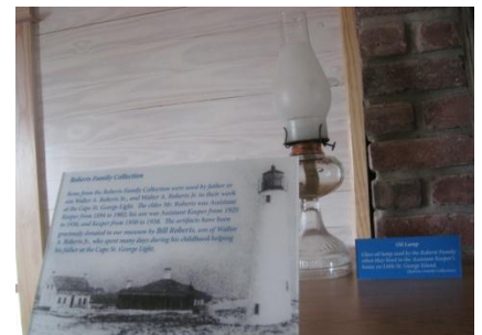
The Roberts Family Collection