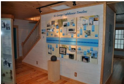
The Timeline display honors SGLA member Penny Angel.