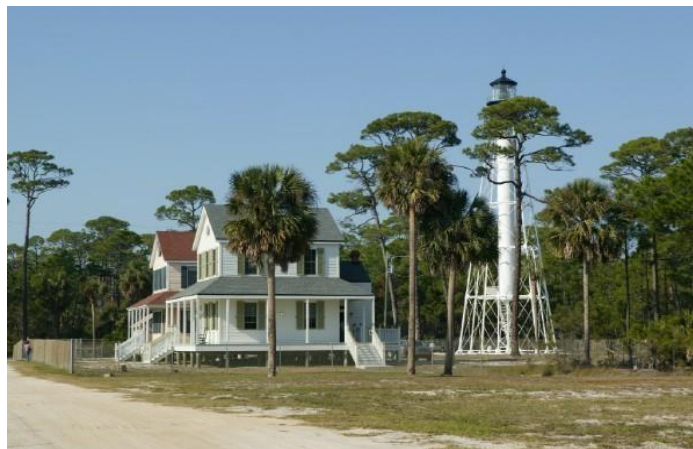
The Keeper's Cottages at the Cape San Blas Lighthouse

Tickets are $10 each and are available in the Cape San Blas Lighthouse Gift Shop or by contacting Beverly Douds at 850-229-1151 or csblighthouselady2008@gmail.com . The drawing will be held on April 1, 2012.