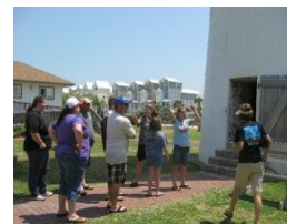
A crowd waits to climb.