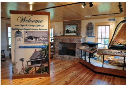
The Lighthouse Museum.