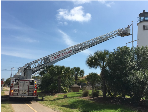
Ladder Truck 7 at the Lighthouse