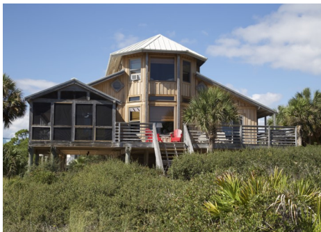
"Dunestuck was featured on the 2016 Tour of Homes"

The 250-plus surveys returned by visitors heaped accolades on the homes, the transportation system, and the friendly volunteers. A drawing for two free tickets to next year's tour successfully incited more people to complete the surveys, but just like with big bucks lotteries, our winner from Hartford, Wisconsin, has yet to come forward!