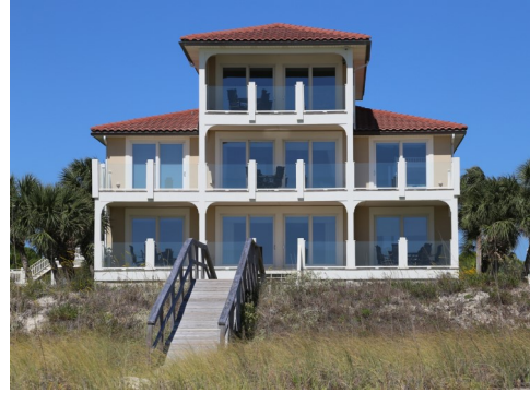
"A Dream to Sea" on the East End was popular with Tour visitors."

The St. George Island Tour of Homes on February 13 secured its status as the primary annual fundraiser for the Cape St. George Light with another record profit of $15,000, slightly exceeding the final proceeds of the 2015 tour.