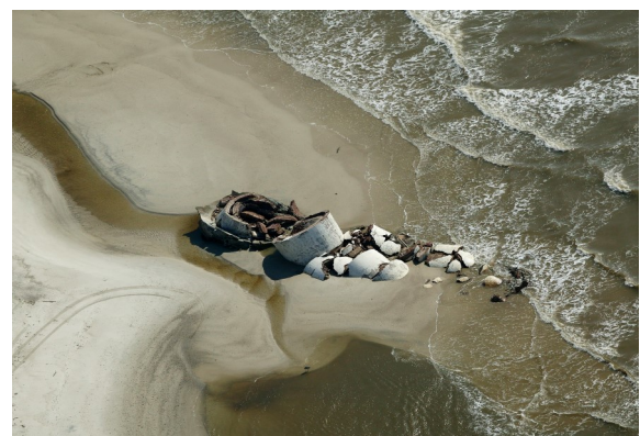
Sands and surf swirl around the fallen lighthouse

Had the lighthouse on Cape St. George survived 2005, it would probably still be standing on the Cape! In the long term, however, the dynamics of coastal change suggest that the old lighthouse would have collapsed sooner or later.