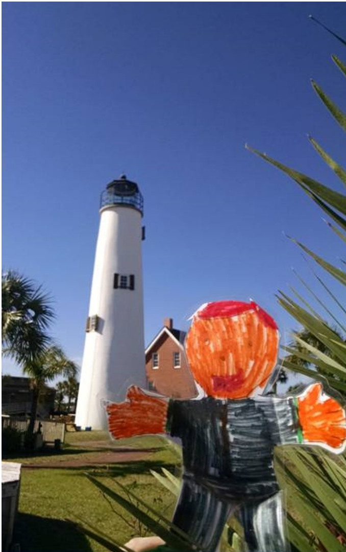
Flat Stanley visiting Cape St. George Lighthouse