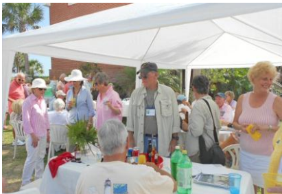
The crowd under the tent.

Once again the St. George Lighthouse Association hosted a reception for Plein Air artists visiting the area for the Plein Air Invitational Paint-Out, May 3-13.