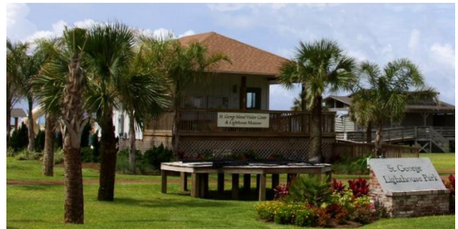
The St. George Island Visitor Center & Lighthouse Museum