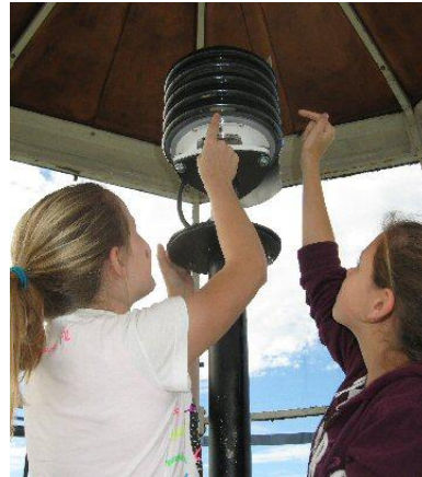
Visitors check out the Vega optic.