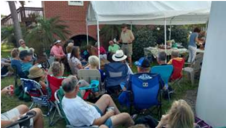
President Skip Kemp reviews plans for the possible expansion of the Keeper's House and new museum exhibits