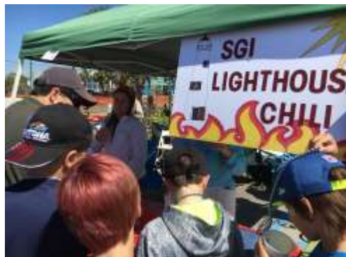
Crowds gather at the SGI Lighthouse Chili Tent