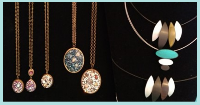
Vintage Crystal Pendant Necklaces: Sparkle galore. The pictures don't do them justice. Made of an assortment of new and vintage crystals. The metal is antiqued brass. A wonderful statement piece.