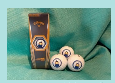
Cape St. George Lighthouse Golf Balls: Features the image of our lantern room.