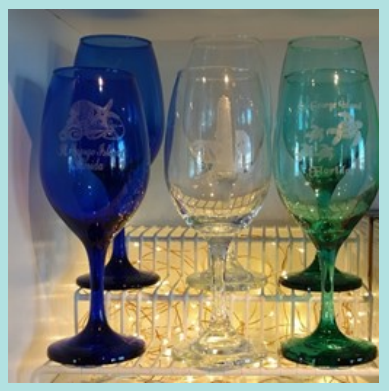
Laser Etched Wine Glasses: Available with the image of our lighthouse, shell cluster or turtle family image. Colors available are Cobalt Blue, Agua and Clear.