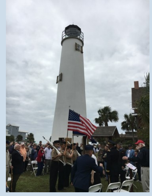
Port St. Joe Navy Jr. ROTC, posting of the colors