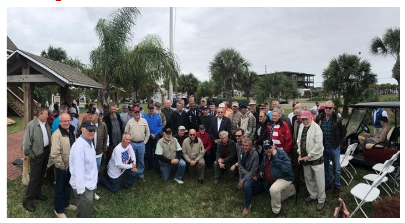
Over 65 veterans were in attendance at the first annual Veterans Day Ceremony hosted by St. George Lighthouse Association. We are proud to honor our veterans all over the world and thank you for your service.