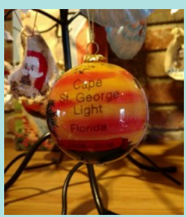
Holiday Ornaments featuring the Cape St. George Lighthouse and Keeper's House: These ornaments are painted in minute detail from the inside of the glass in an ancient art form. There are two