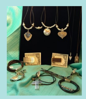
Men's/Women's Leather and Metal Jewelry: A great selection of pendant necklaces and bracelets. Money Clips are a great new offering.