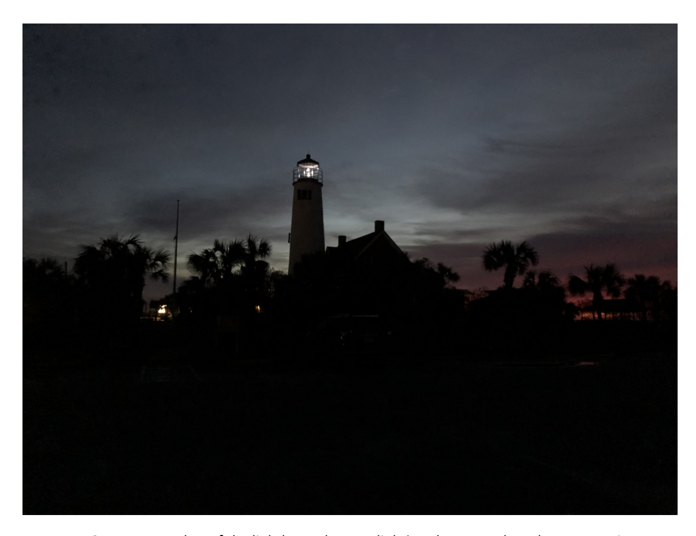
Great sunset shot of the lighthouse beacon lighting the way.