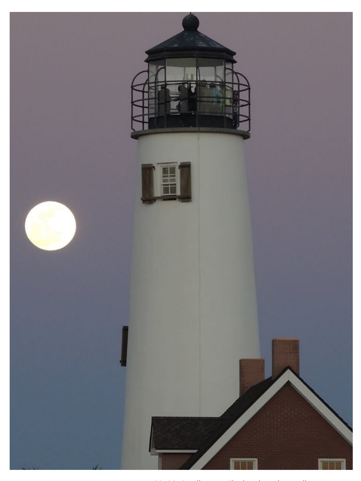
January 20, 2019 Full Moon Climb.