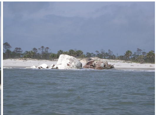
Spring 2006 , after the fall