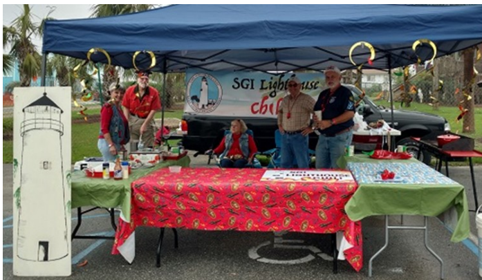
SGI Lighthouse Association Booth

Our very own SGI Lighthouse Crew didn't let the rainy weather stop them from cooking up some fabulous chili at this year's cook-off while raising money for the SGI Fire Department.