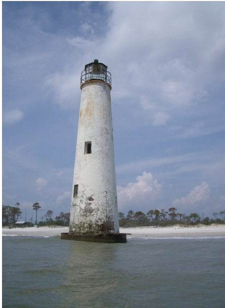
Labor Day, 2005