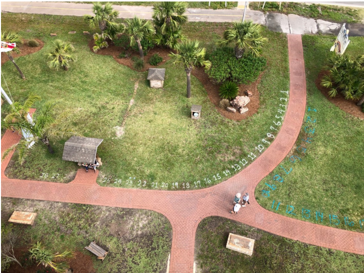
View from top of lighthouse prior to the Quick Draw Event.

On May 3—12 the Forgotten Coast Plein Air hosted their annual event and the very popular Quick Draw event was held in Lighthouse Park on May 4th. The day ended with SGLA hosting a reception for the visiting artists (over 50 of them!!)