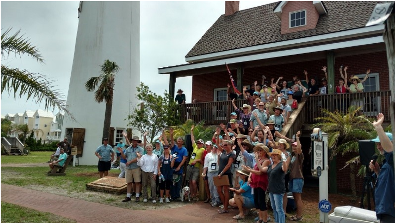
Over 50 artists participated in the popular Quick Draw event that was held in Lighthouse Park this year!!