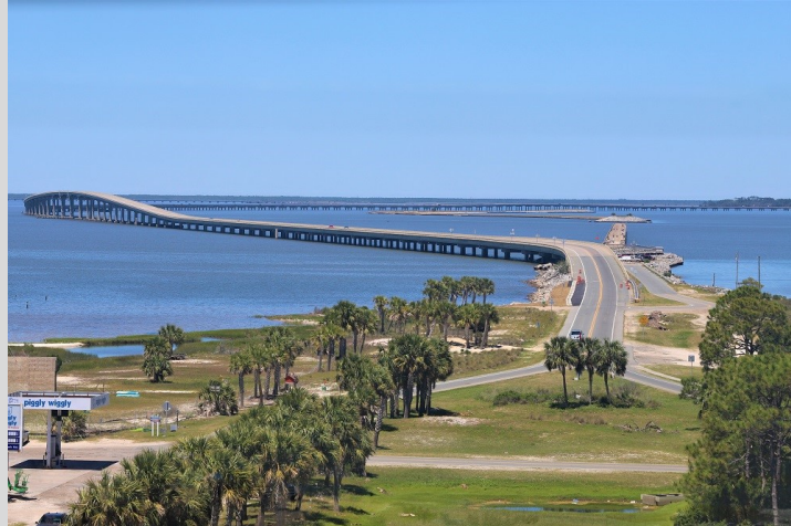
View from the top of the lighthouse

Drew and Chuck's knowledge and experience will be a valuable asset for the association and community.