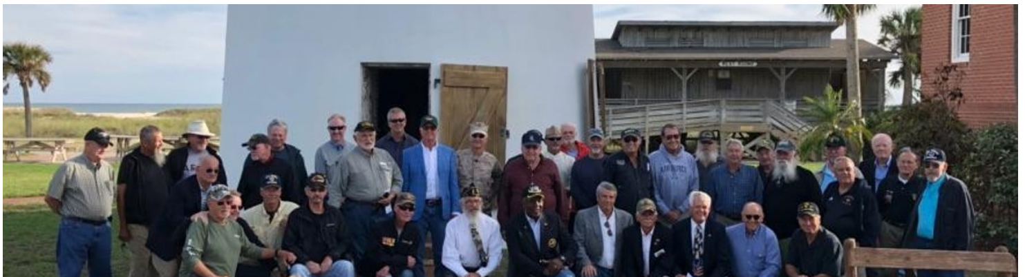
Group photo from the 2nd Annual Veterans Ceremony held in 2018