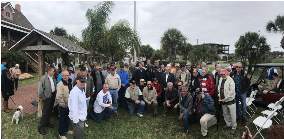
Group photo from the first Veterans Ceremony held in 2017