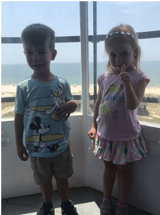
First time climbers are finally tall enough to be included in the Brooks family tradition.

Grandpa and Grandma Brooks purchased a brick paver as a birthday surprise for one of their nine grandchildren. Three of the Grands purchased a paver in 2018 in honor of the SGI family tradition and their grandparents.