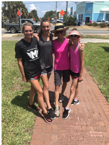
Three of the Grands standing by the paver they purchased in 2018 for their grandparents.